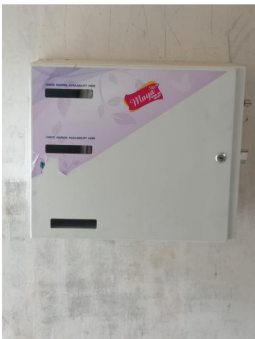
Napkin Vending Machine