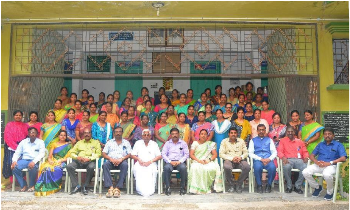
Career counseling workshop for housewives sponsored by the National Commission for Women, New Delhi.