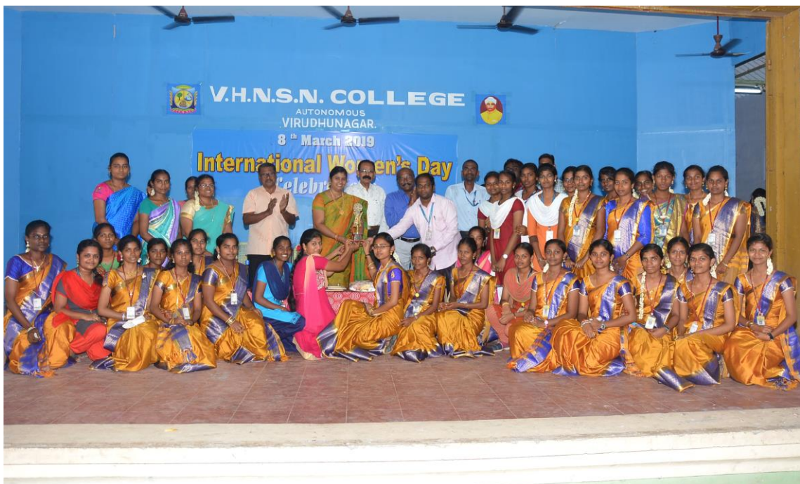
Women's day celebration in our institution.