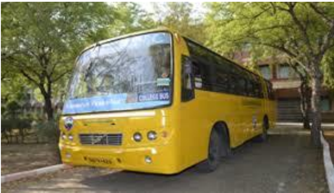
Separate Bus facility for Girls