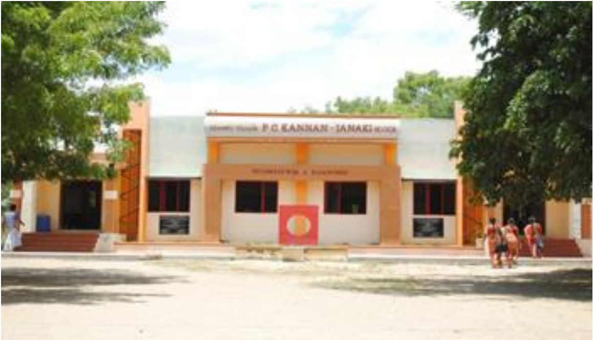
Separate counter and dining space for girls in Canteen