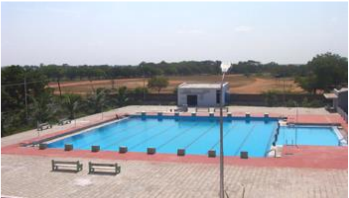
Specific time (2:00-3:00 pm) for girls in swimming pool